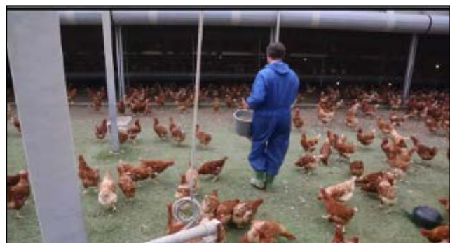
Rondeel system with Lohmann Brown Lite breed of hen