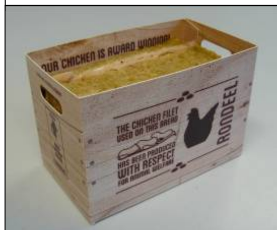
KLM in-flight chicken sandwich box